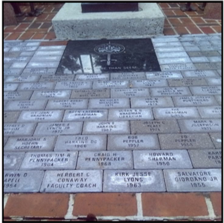
Top Photo: BMI Reunion 2022 Honor Guard. Left Photo: J.C Platt BMI VP rank CW04. Right Photo: Our newly installed pavers.