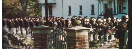
Bordentown Military Institute Friends Public group · 211 members

A great way of keeping track of BMI events of course is the Bordentown Military Institute Alumni Association's BMI Cadets page on the computer plus of course articles in the Skirmisher. On Facebook there are also two Pages for BMI, (1) Bordentown Military Institute Friends (of which I'm the Administrator) and (2) Bordentown Military Institute. Posts as well as comments of course are always welcome from our former Cadets, Staff Members or family members of either. BMI Friend's also has a BMI Chat room. A lot of us have brought up events and things We remember from our Cadet Days both on the Facebook Comments on postings (many include pictures and narrative) and other subjects within the Chat room of BMI friends.